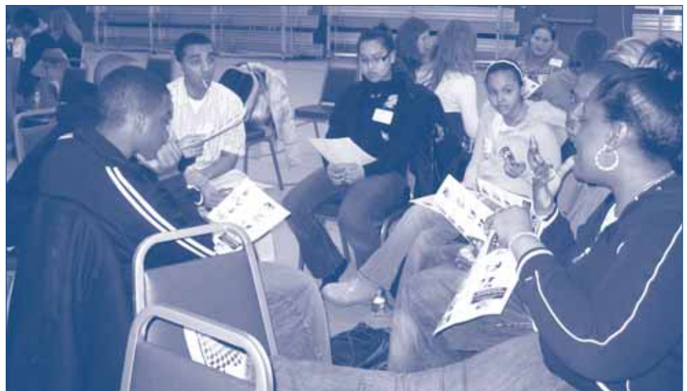
YLEC LOOKS TO THE FUTURE OF OUR COMMUNITY.