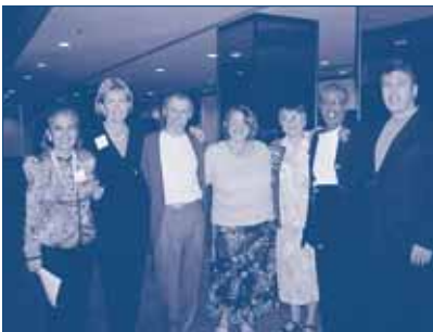
LB'ERS ENJOYING LAST YEAR'S VALUES AWARDS LUNCHEON.