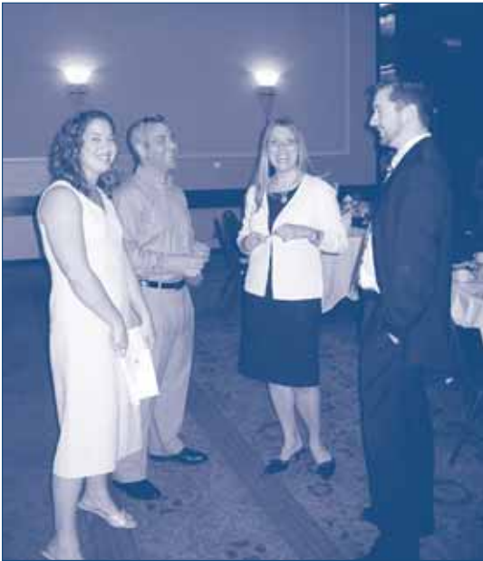
RL'S CONVERSING AT THE 2006 VALUES AWARDS LUNCHEON.