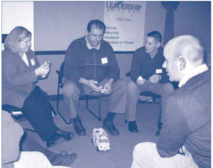
CLASS EXPERIENCE OPENING RETREAT: "WHO ARE THE RIGHT PEOPLE FOR OUR BUS?"