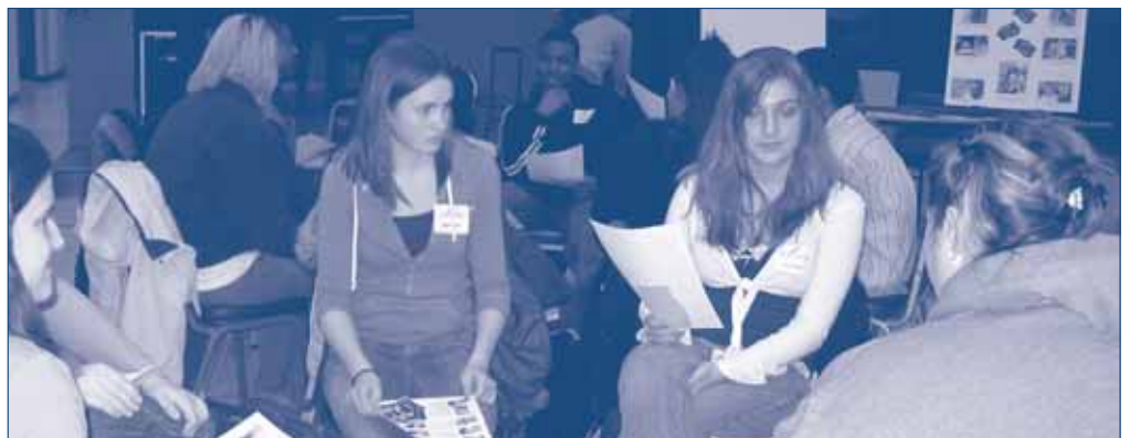
YLEC: "WHERE SHOULD WE PUT OUR COMMUNITY CARE DOLLARS?"