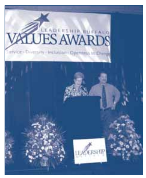
VALUES PRE-SHOW REHEARSAL.