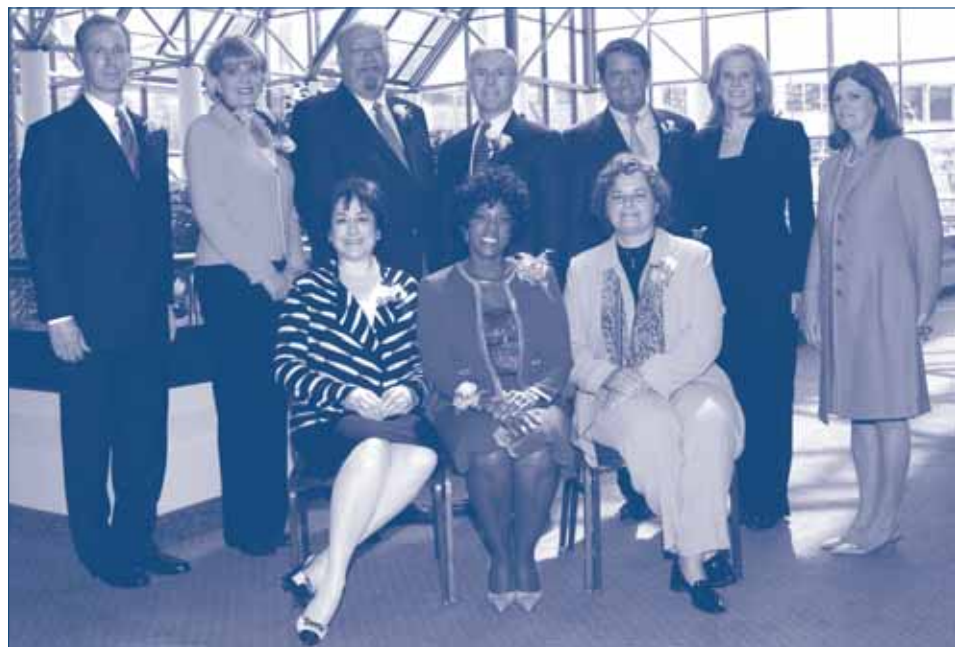
THE HONOREES AT THE FOURTH ANNUAL LEADERSHIP BUFFALO VALUES AWARDS LUNCHEON.